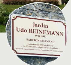
Garden next to Saint-André church, named after this beloved honorary citizen