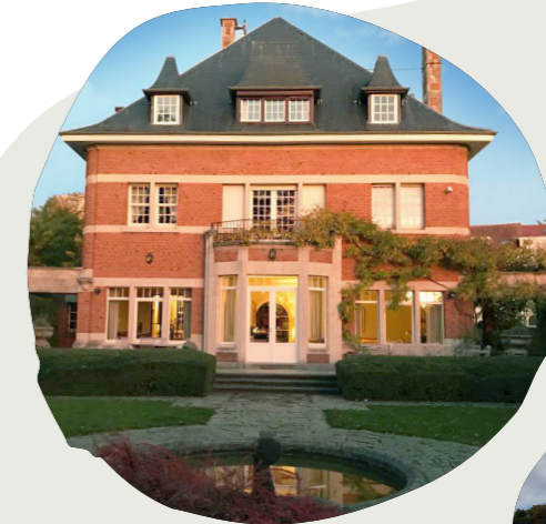
Maison Solanet, Urim's home