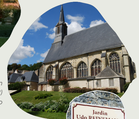
Song recital in Saint-André church (FR) for one selected duo